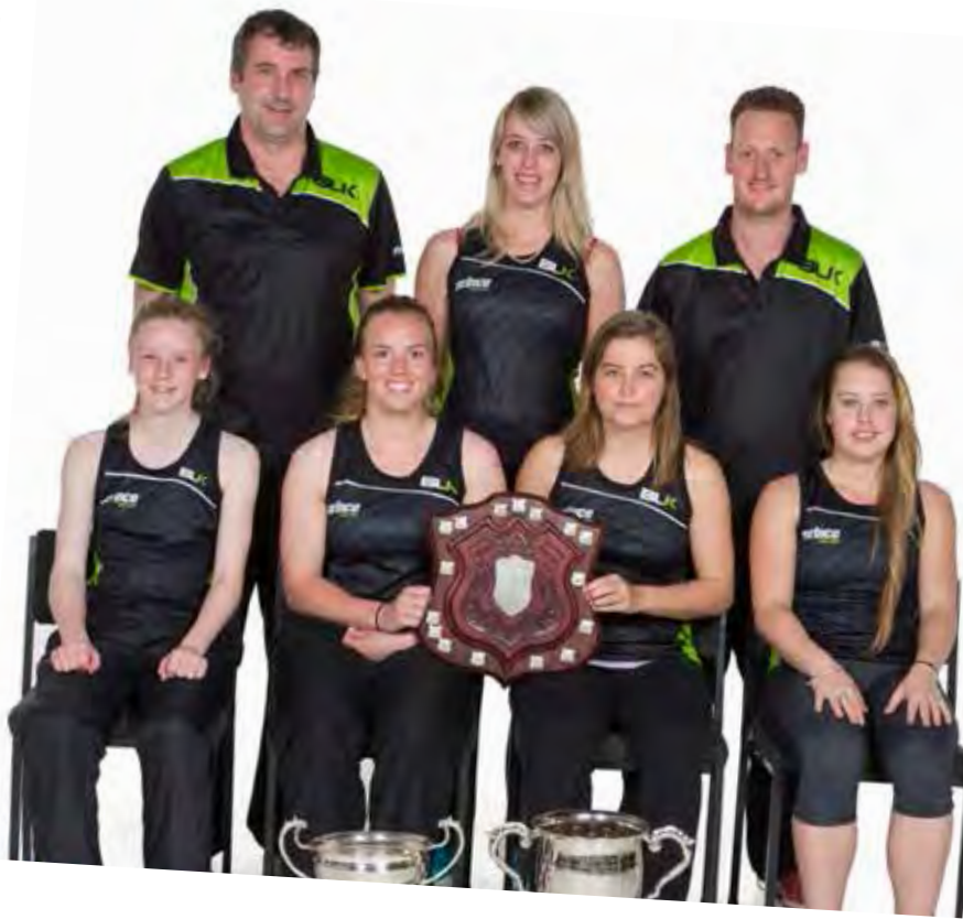
2014 SQUASH CENTRAL WOMEN'S REP TEAM NEW ZEALAND CHAMPIONS!