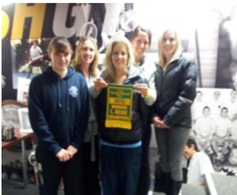
SquashGym C grade women

Kawarua Park Rangitikei SquashGym SquashGym