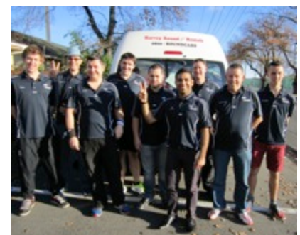
Above: Wanganui E grade men